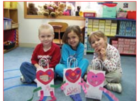
Valentine's Day was a treat!

Next we jumped in to a unit on Health and Nutrition for the rest of the month. Our centers revolved around it with the favorite being the Preschool Pizza Store that we set up. You could come in and order a pizza (made the way you wanted it), get some bread sticks, some fries and even