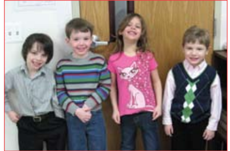
Kindergartners celebrated "dress up" day in their own ways.

Up next is the "Spring Thing" and we're busy working on our song. Come and see us on March 22nd as we perform on stage.