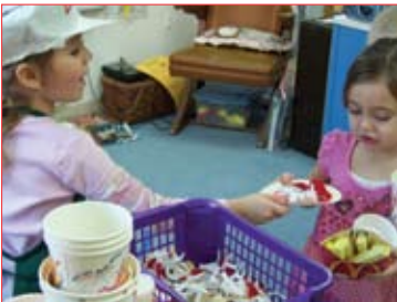
The Preschool Pizza Store was fun and educational.